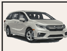
2020 Honda Odyssey Minivan

Each year we are invited to participate in a five-car raffle hosted by All Saints Church in Manassas. Prizes include five 2020 vehicles from Koons of Manassas (Honda Civic, Buick Encore, GMC Canyon Truck, Honda CRV Sport Utility and Honda Odyssey Van). One $5.00 ticket offers the purchaser a chance to win one of five vehicles plus $20,000 in cash prizes. As a result of last year's Car Raffle, St. James received $14,000 in support to our various outreach ministries. Whether it be flowers for the Church or food distributions to the poor, this annual Car Raffle helps St. James serve the needs of our wonderful parish. Please consider selling/purchasing the tickets mailed to you. If you need additional tickets beyond what you receive in the mail, you can purchase them in the rectory until April 21.